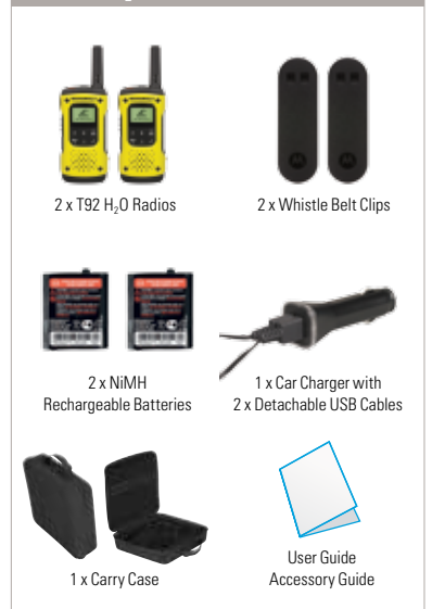
2 x T92 H 2 O Radios